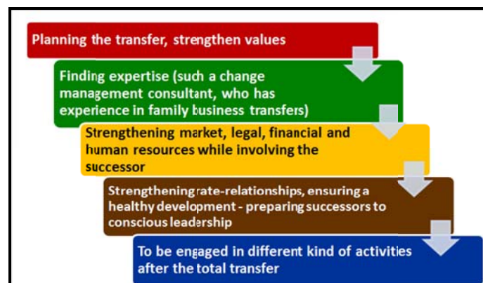
Figure 2. Most important steps of transfer