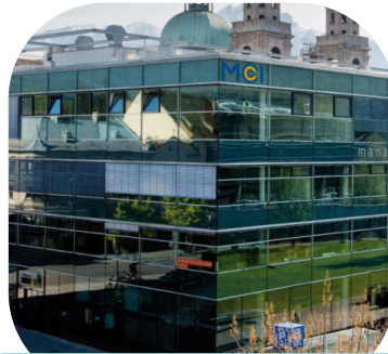
Management Center Innsbruck