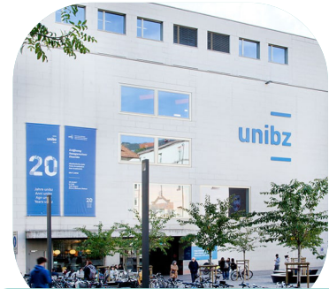
Libera Università di Bolzano