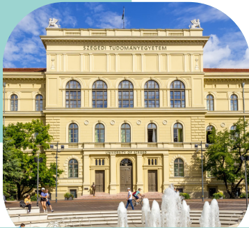
University of Szeged

in an international consortium of six partners: