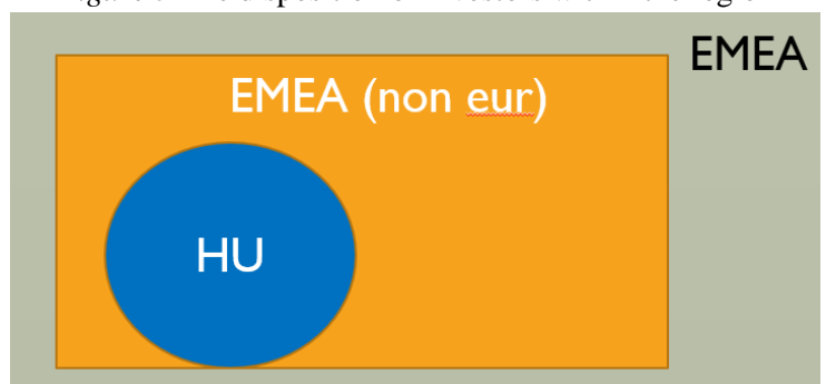
Figure 3 The disposition of investors within the region

As a result of the symmetric copula tests we can conclude the Slovakian market dominates the Hungarian market. It could be caused on the one hand, by the shared set of investors from the countries of the CEE region, on the other by the euro denominated debts in Slovakia, which allow it to enjoy the advantage of broader acceptance of its currency without FX risk to the investors. Hungary seems to be the bottleneck within the region, as Hungary is the only country offered 'junk' or not recommended sovereign debt by credit agencies. We can infer that the investors, who invest into Hungary also invest in the region, while CEE investors might not invest in Hungary due to their risk appetite or investment policy. As a result of this phenomenon if something happens to CEE investors, it certainly affects the Hungarian bond market, while Hungarian bond market investors are just a smaller proportion compared to CEE investors as you can see it on figure 3.